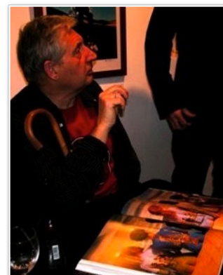
Storm Thorgerson signing books at the exhibition of original works and launch of Mind Over Matter at Elms Lesters Painting Rooms, London.. Photo: P. Morris