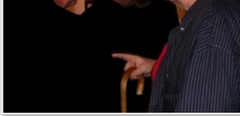
Storm Thorgerson and Nick Mason of Pink Floyd at the exhibition of works and book launch of Mind Over Matter.