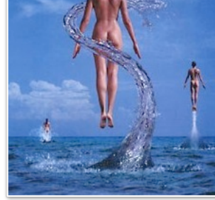
Shine On (1992)