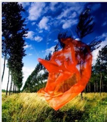
Wish You Were Here (Liner bag) (1975)