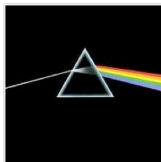
The Dark Side of the Moon (1973)