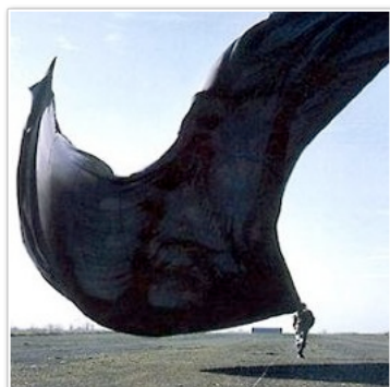
High Hopes (1994) - single.