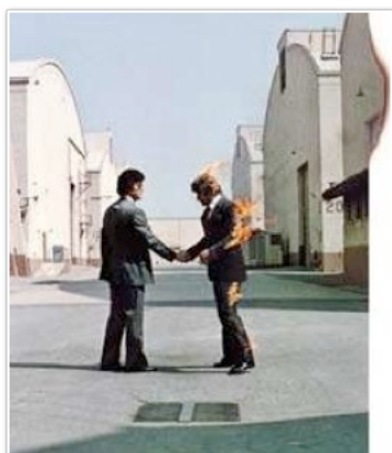
Wish You Were Here (1975)