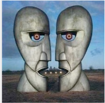
The Division Bell: Metal Heads (1994) (USA release cover) The 15 metre high/1500 kg heads are now in the Rock 'n Roll Hall of Fame in Cleveland, Ohio.

a.m. to take me out to the pyramids. So there I am, thinking I'll be fine, and I put the camera on the tripod to do a long-time exposure. It's a wonderful, clear night, and the moon is fantastic. So I'm doing it...and then, at like 4 o'clock a.m., these figures come walking across - soldiers, with guns. I thought, 'This is it. The game is up - young photographer dies a strange death in a foreign land.' I was actually really scared. Of course, all my fears were unfounded. They were really very friendly. They wanted a bit of bakshish , a little bit of money to go away. They kindly pointed out that where I stood was actually a firing range, and they'd come to tell me it wasn't very cool for me to be there. If I was there first thing in the morning, I might get a bullet up my butt."